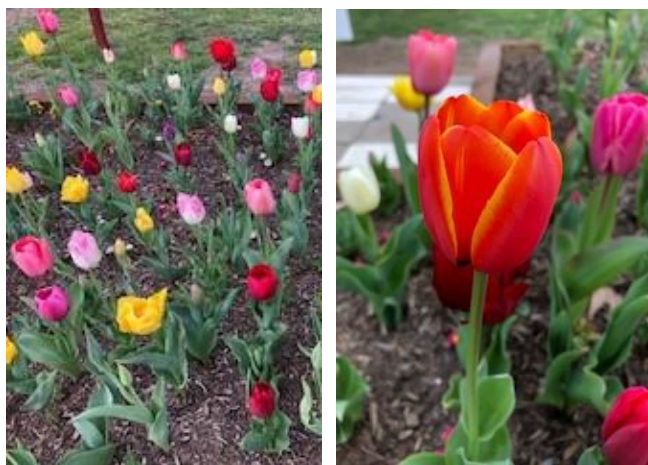
Floriade Re-Imagined at our school