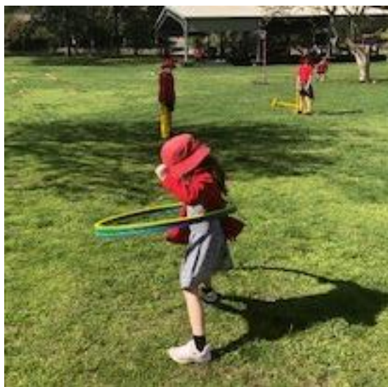
Hoola Hoops are fun